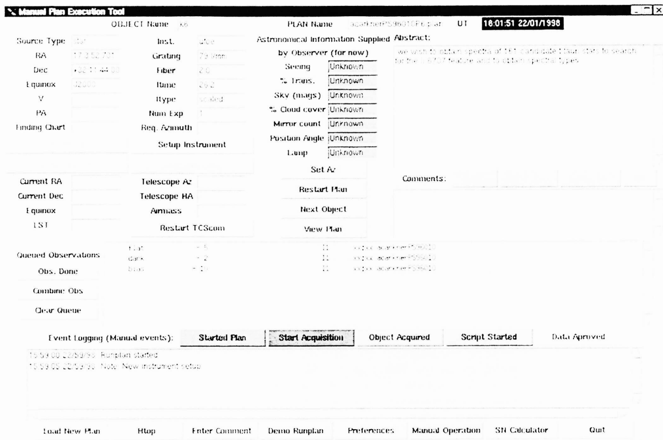
Figure 4 – Our initial plan execution tool. This tool both informs the resident astronomer of what needs to be done as well as creates scripts to be executed by the instrument control system once all manual setups are taken care of. The scientific abstract for the project and any additional comments the PI intends for the resident astronomer to read are displayed. Finally, a list of queued calibrations that are needed to complete this and any previously executed plans are displayed as a reminder of what must be done to complete all open plans. From this interface, the resident astronomer can go into a manual operations mode to run the instrument directly to examine instrument performance or to alter the way a plan is executed.

console. Using this display and several IRAF quick-look tasks, he/she can make changes in how the remaining frames will be acquired. Further, the resident astronomer can examine the data to determine if the parameters as described in the plan are sufficient to obtain the data required for the project. If the data quality is too low and there are no other contributing factors leading to the poor data quality, the resident astronomer may choose to put the entire project on hold pending further interaction with the PI.